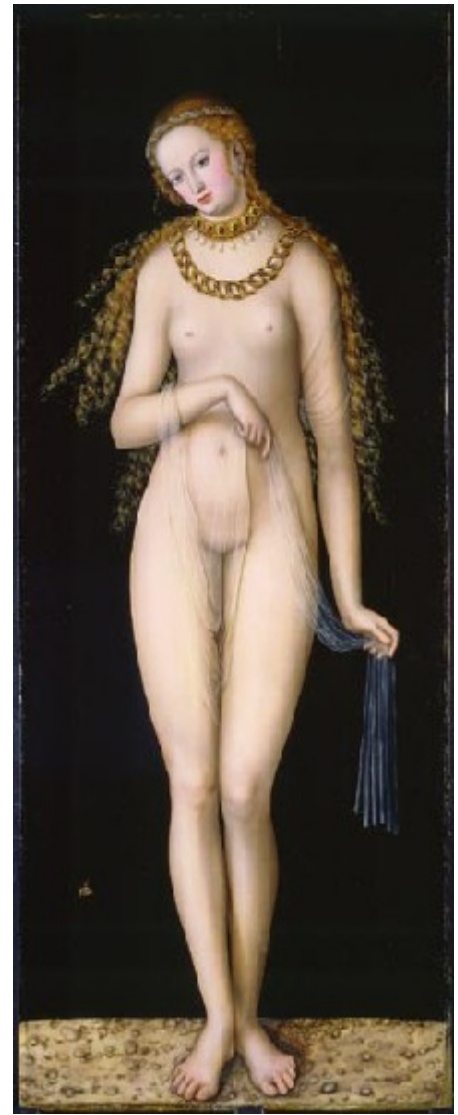
Figure 5 Painting by Lucas CRANACH(I)